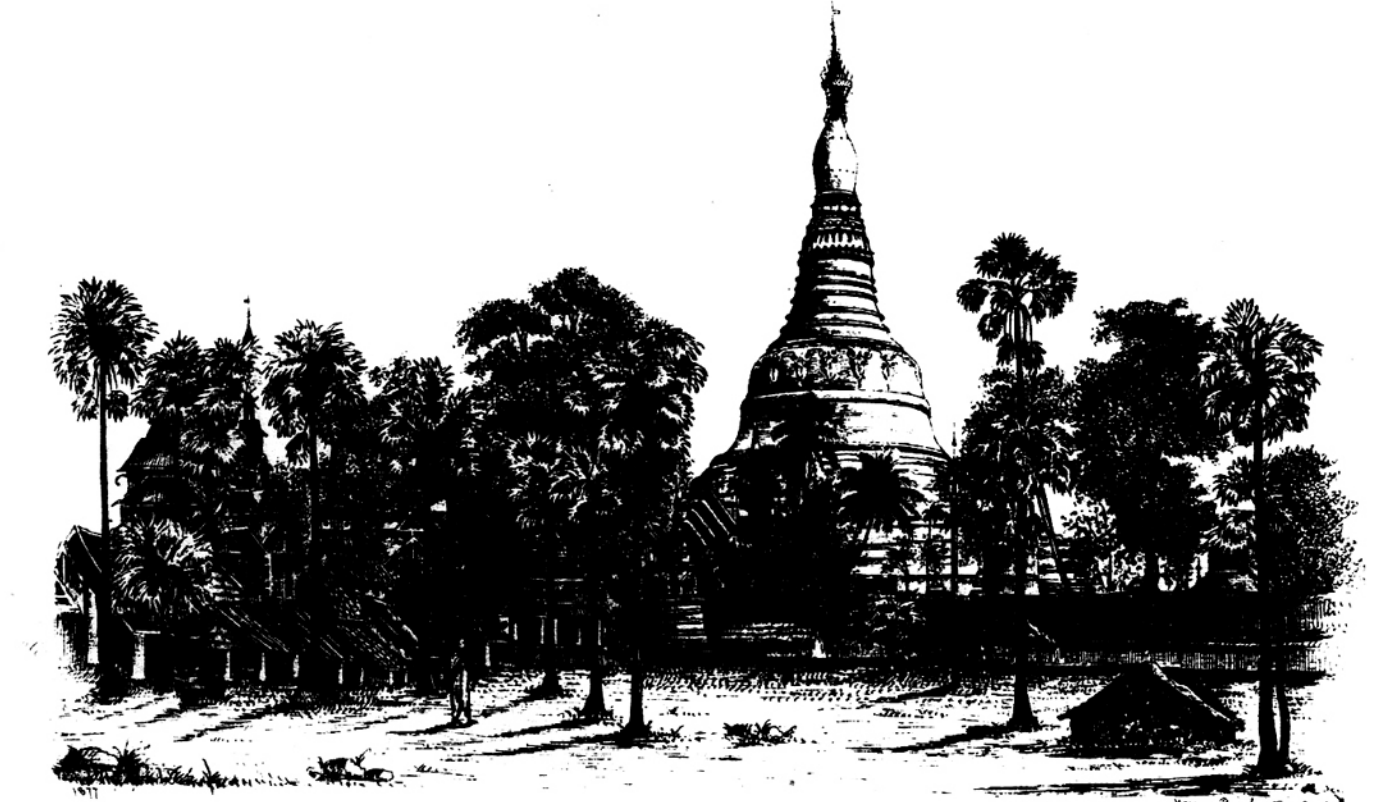
SHWAY DAGON PAGODA

Height of Spire above Mean Tide Level 511.48 Top of Spire above Crown of Road at South Side 488.76 Top of Spire above Crown of Road at North Side 512.03 Note: The above were obtained from a series of observations.